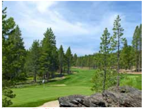
The Club at Gray's Crossing